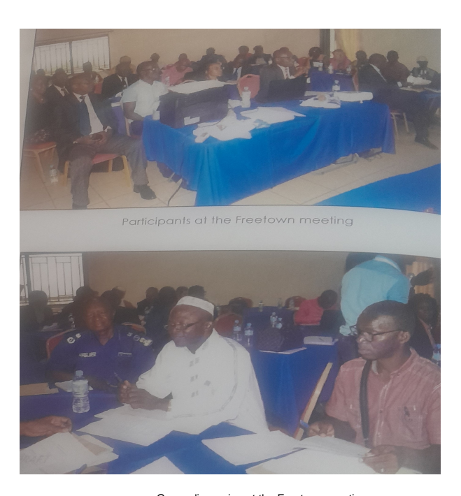
Group discussion at the Freetown meeting