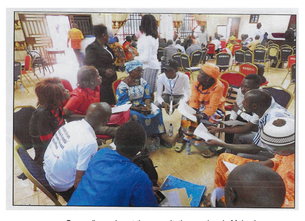
Group discussion at the consultative seminar in Makeni