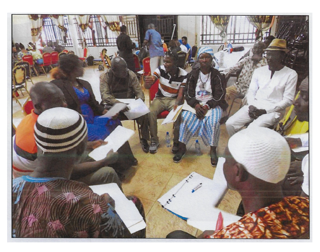
Group discussion at the consultative seminar in Makeni