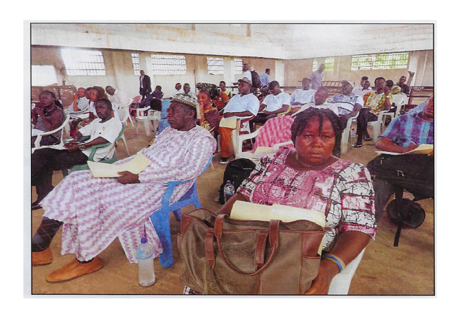
Participants at the consultative seminar