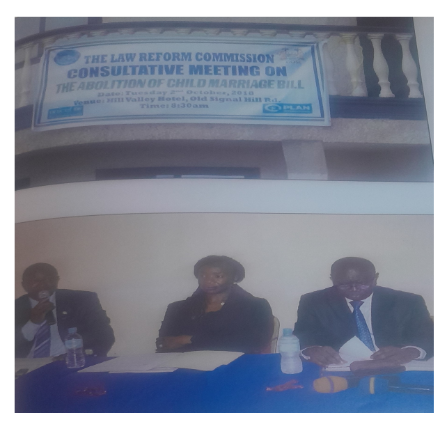
The Honourable Mohamed Haji-Kella, Deputy Minister of Social Welfare, Gender and Childrenîs Affairs speaking at the Freetown meeting